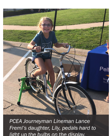
light up the bulbs on the display.